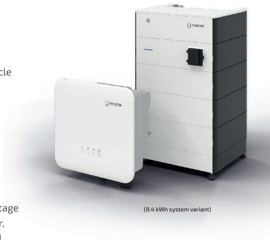
(8.4 kWh system variant)