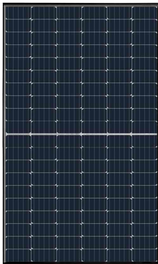
PV Module 25 Years Linear Performance Warranty