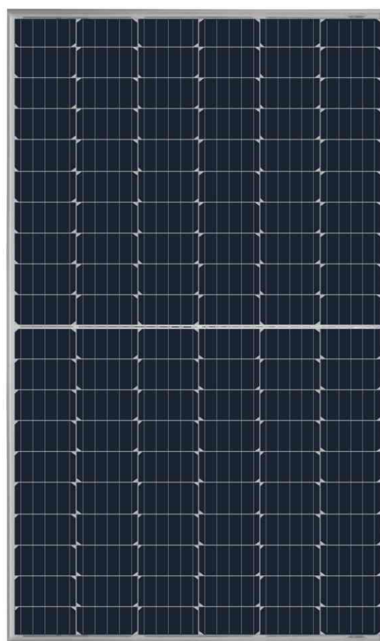
PV Module 25 Years Linear Performance Warranty