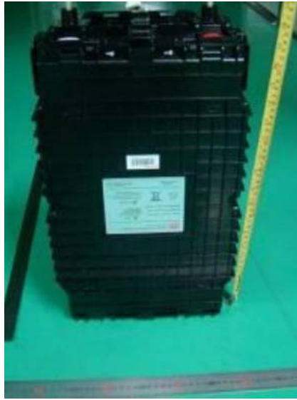
电池/ Battery ( C12_4SI 12,8V 200Ah 2560Wh )